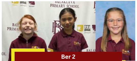
Ber 2 Ebony, Lilo & Amahli