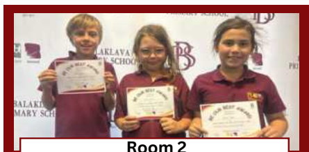
Room 2 Fletcher, Justice & Khaleesi