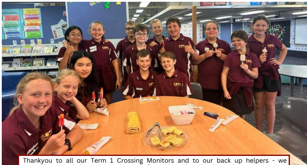
Thankyou to all our Term 1 Crossing Monitors and to our back up helpers - we appreciate your help each morning and afternoon at the school crossing.