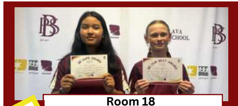
Room 18 Casey & Indi