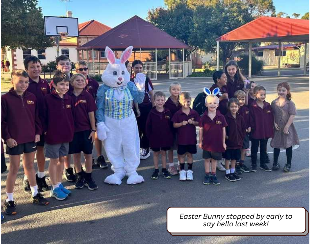
Easter Bunny stopped by early to say hello last week!