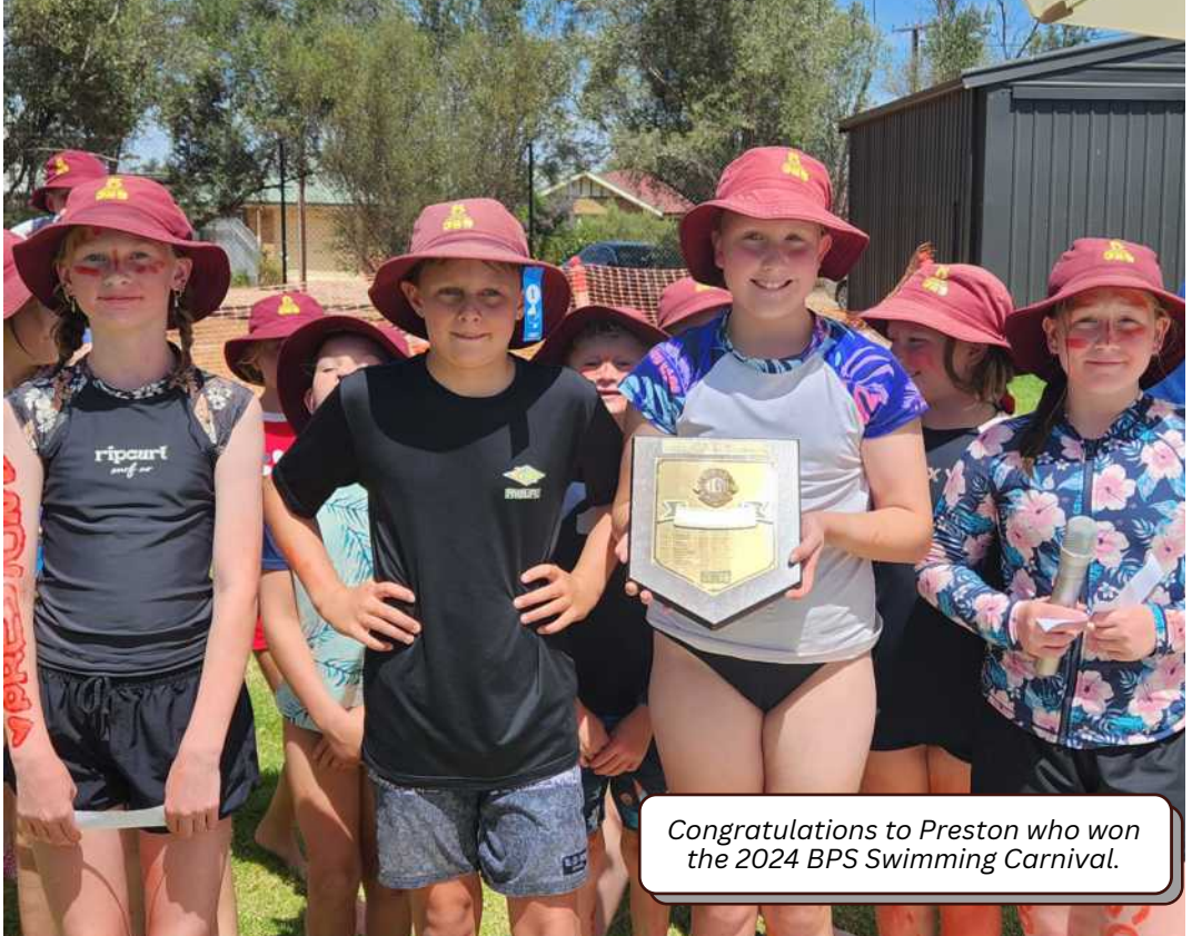
Congratulations to Preston who won the 2024 BPS Swimming Carnival.