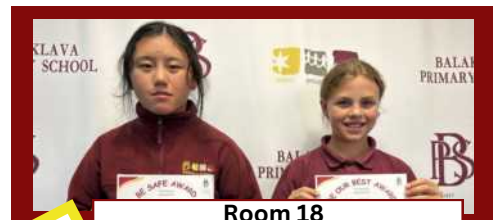
Room 18 Athena & Amity