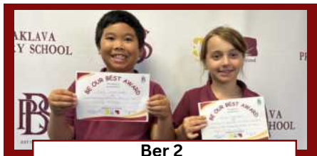
Ber 2 Lans & Aria