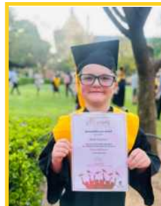
Wyatt Bronze Award - 30 Hours