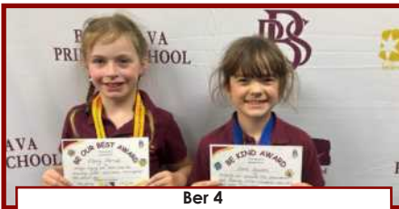
Ber 4 Ebony & Zara