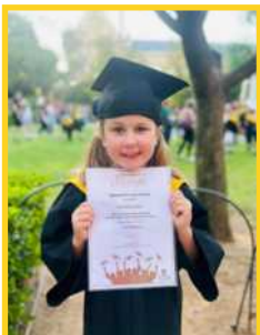
Matilda Bronze Award - 30 Hours