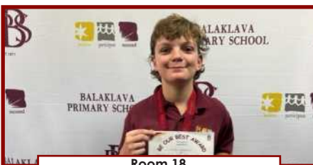
Room 18 Zander