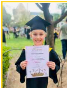
Zoe Gold Certificate - 200 Hours