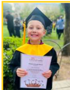
Leo Bronze Award - 30 Hours