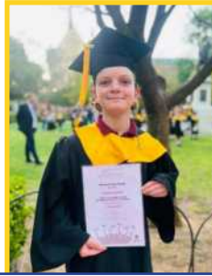
Zander Silver Award - 65 Hours