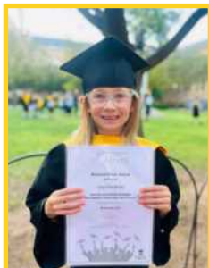
Sage Silver Award - 65 Hours