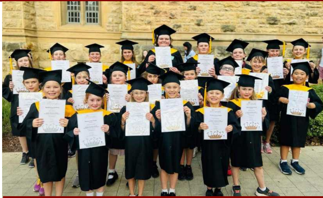
Congratulations to our 2023 Children's University Graduates.