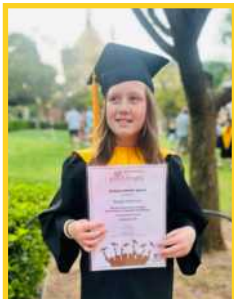
Brooke Bronze Award - 30 Hours