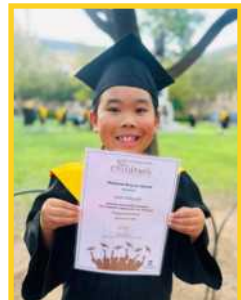
Lans Bronze Award - 30 Hours