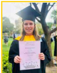
Lexie Silver Award - 65 Hours