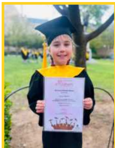
Lucy Bronze Award - 30 Hours