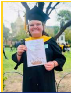
Logan Bronze Certificate - 130 Hours