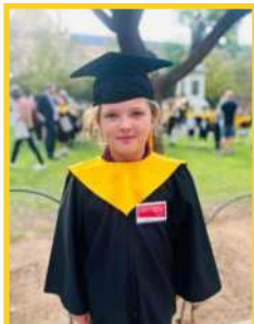
Penelope Bronze Award - 30 Hours