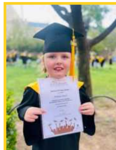
Pip Bronze Award - 30 Hours